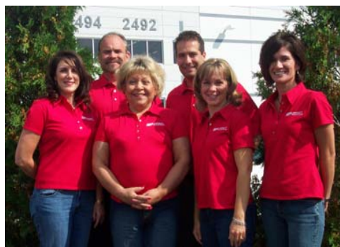
Your Impact Team !