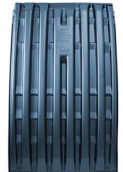
Double Impact Lid of today! 2009