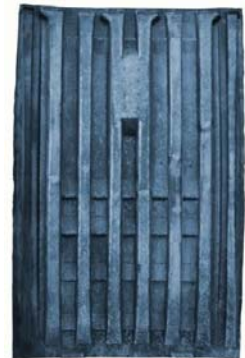
The Lid where it all began in 1999!